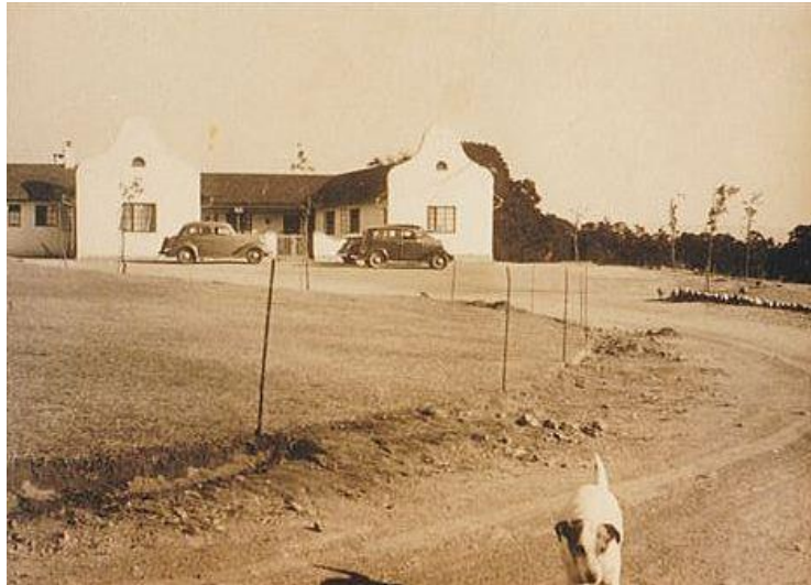
2 Cars & a dog